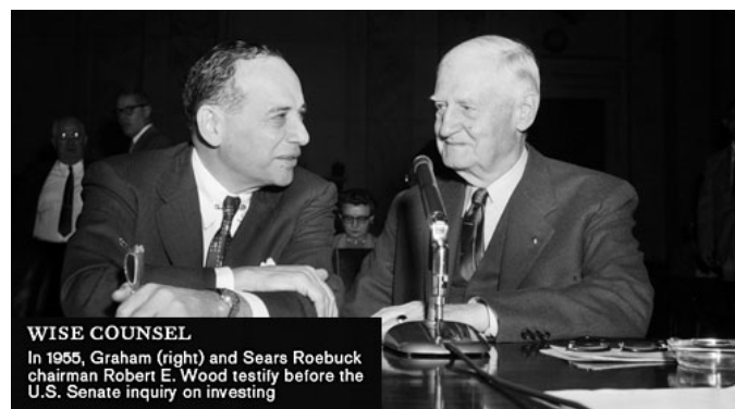
WISE COUNSEL In 1955, Graham (right) and Sears Roebuck chairman Robert E. Wood testify before the U.S. Senate inquiry on investing

“The true measure of common stock values, of course, is not found by reference to price movement alone, but by price in relation to earnings, dividends, future prospects, and to a small extent, asset values. ”